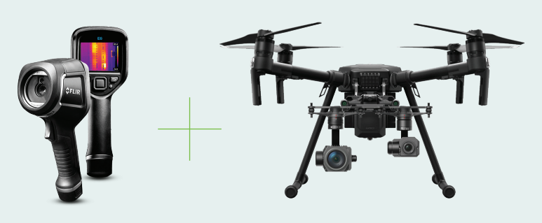
HANDHELD (for indoor environments)

Mechanical Testing Inc. offers thermal imaging in two critical forms as part of our FULL PROJECT AWARENESS customer offerings.